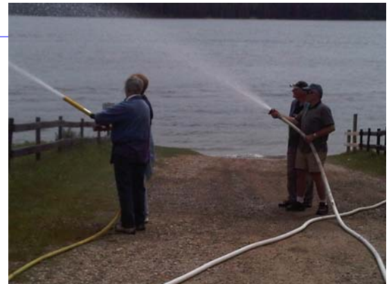
The Village’s fire caddy (first response fire protection system) was demonstrated after our annual Canada Day community meeting.

! Decks and stairways along the shoreline are of course exempt under the encroachment policy. Agreements are being arranged with deck and stairway owners.