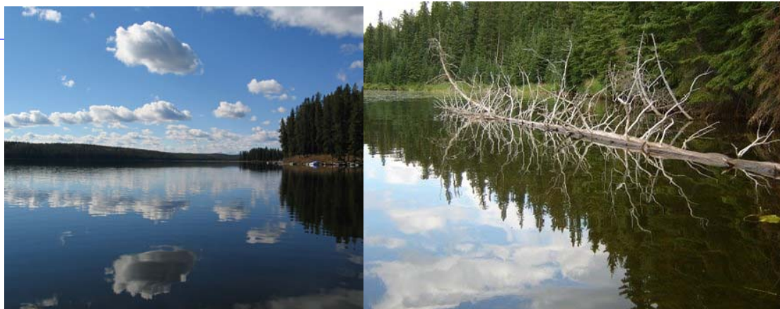
Thanks everyone who contributed their pics. We are looking for more, please!